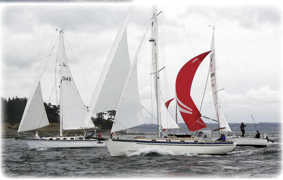
www.48North.com June 2014