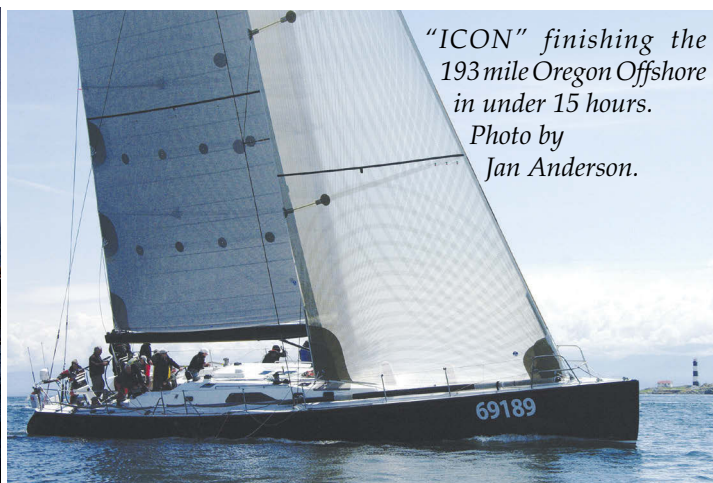
"ICON" finishing the 193 mile Oregon Offshore in under 15 hours.